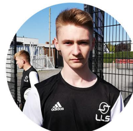
CAI LLS STUDENT

Sports psychology is something that I've taken an interest in after studying psychology with players like Jesse Lingard and Aaron Lennon openly struggling with mental health issues. Becoming a sports psychologist can give me the opportunity to support players at all levels who have struggled and allow them to release negative thoughts and focus on improvement and consistency in their jobs.